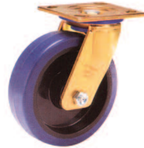
Yellow Zinc Swivel Caster