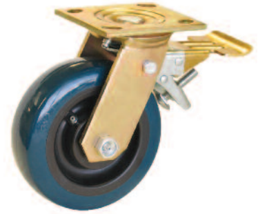
Yellow Zinc Swivel Caster with Optional Adjustable Metal Total Lock Brake